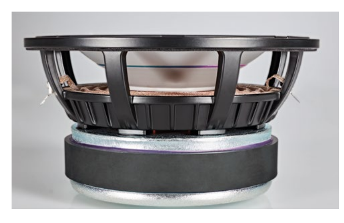
The new bass drivers are based on sophisticated die-cast aluminium baskets fitted with extremely powerful magnets, while the very latest suspension system is the key to their enormous cone travel.

The R 300 is equally suitable for mounting on a bookshelf and on the LS 300 stand.