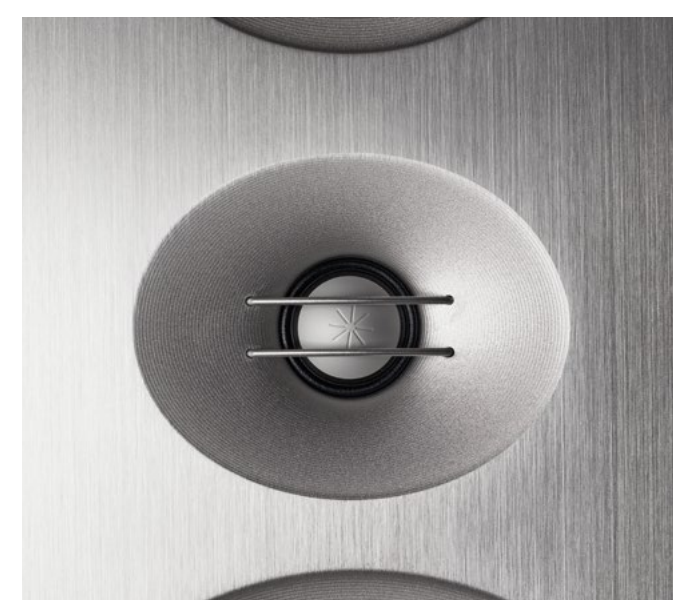
The new "Ultra Wide Range" treble unit features an embossed cone which makes it extremely rigid despite its ultra-low weight. It is positioned in the centre of a precisely calculated waveguide designed to optimise the driver's radiation characteristics in the mid / high-frequency range.