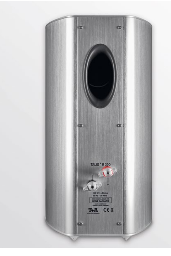
The bass reflex port is located on the back of the speaker; a damper can be fitted if required. Threaded sockets on the underside accept our spikes or furniture glide pads.