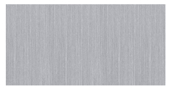
Silver anodised 43