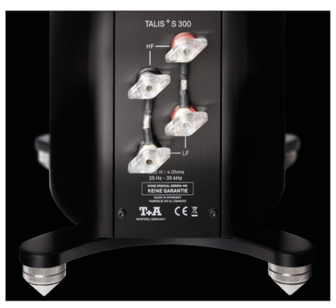
The speaker terminals are equipped with cable clamps of the highest quality, suitable for bi-wiring and bi-amping. The spikes can be dismantled, and terminate either in pointed metal cones or plastic glide pads for delicate floors.

The sophisticated cross-over unit is assembled using the finest available components. Precisely calculated, fine-tuned for optimum cone travel and transmission characteristics, it has an effortless ability to process extremely high levels, thereby ensuring that all three frequency ranges are superbly controlled.