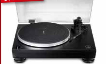
Audio-Technica's AT-LP5X direct-drive turntable