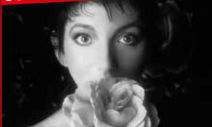
Music Legend: The magical genius of Kate Bush