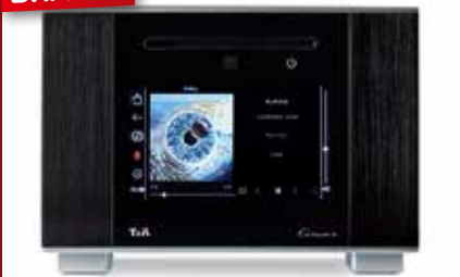
Standing ovation for T+A's Caruso R music player