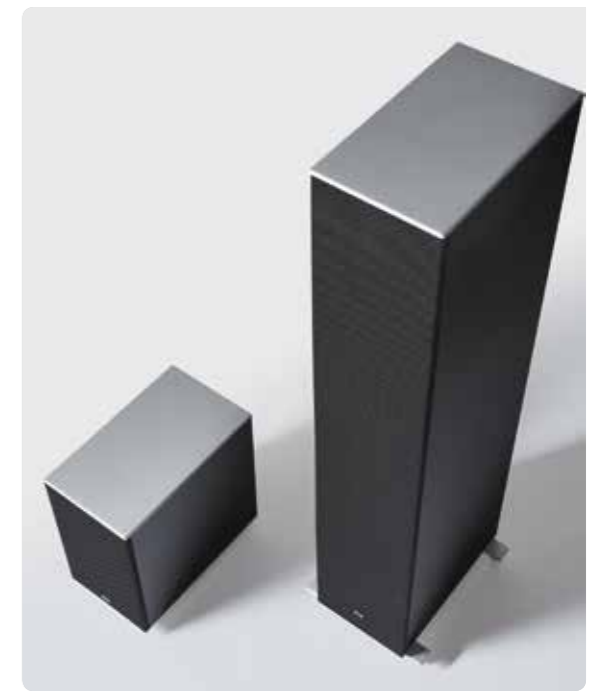
The cube-shaped R10 and S10 floorstander are a great match for the Caruso R

The Caruso R also has a range of adjustments and features in its menu system: aside from 12 presets apiece for both FM and DAB, plus five programmable alarms, there's also selectable input sensitivity; tone and balance controls, a loudness setting to