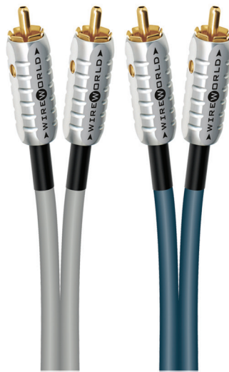
Solstice® 6 SOI

DNA Helix design, 21ga. oxygen-free copper conductors, machined aluminum plugs, silver-clad tubular OFC contacts CL2/FT2