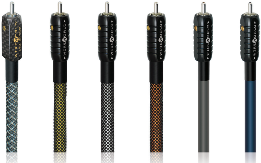
Platinum Eclipse™ PEI

Composilex is only part of the specialized DNA Helix® cable design, which uses a stacked array of four flat conductors to neutralize the electromagnetic loss that filters the signal in other cables. These extraordinary cables are also available in subwoofer, multi-channel and tonearm configurations. The Solstice, Luna and Terra interconnects utilize a simpler version of the DNA design to save cost. The combination of these exclusive technologies, with Wireworld's superior connectors, materials and workmanship, produces the highest fidelity and best value in cables.