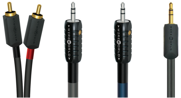
Equinox Mini Jack 6 EQM

DNA Helix design, OCC copper conductors, machined aluminum plugs, silver-clad OFC contacts